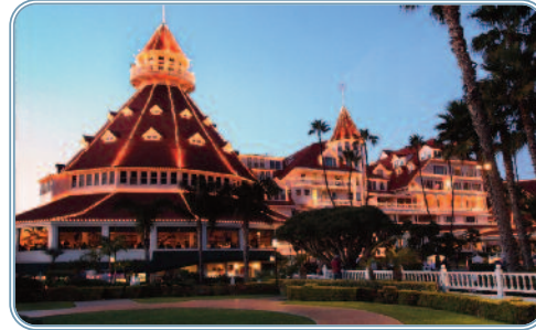
Historic "Hotel Del"

What better way to discover the magic of Coronado Island than on a leisurely guided walking tour?