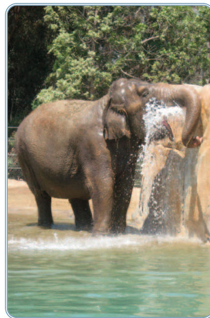
One of the Residents at the Elephant Odyssey

At any time, these pampered pachyderms can mosey into the Elephant Care Center for a massive manicure and foot soak courtesy of the San Diego Zoo staff.