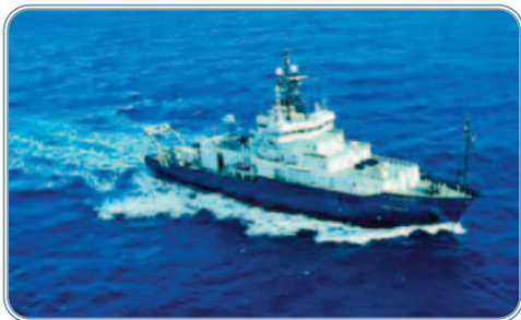
Research Vessel Roger Revelle

With more than a century of exploration and discovery in global sciences, Scripps Institute of Oceanography is the world's preeminent center for ocean and earth research, teaching, and public education. A department of University of California - San Diego, Scripps' leadership in many scientific fields reflects its continuing commitment to excellence in research, modern facilities and ships, distinguished faculty, and outstanding graduate and undergraduate students - and the horizons continue to expand.