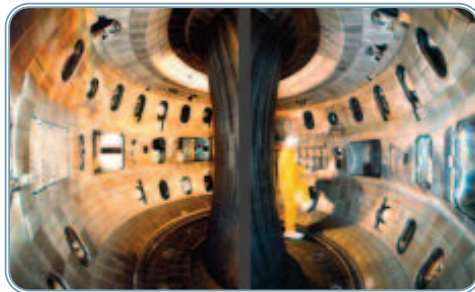
Interior of DIII-D Tokamak plasma reaction chamber

Next, a tour will be given of the DIII-D National Fusion Research Facility, located at General Atomics. DIII-D is the largest magnetic fusion research device in the US.