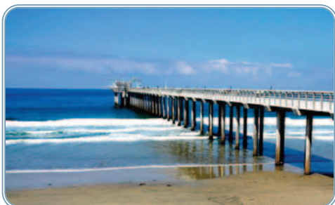
Scripps Institute of Oceanography Pier

Our tour will take participants into the ocean-front research labs at Scripps for explanations of their current research by the scientists leading that work.