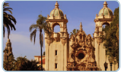
Casa del Prado in Balboa Park

Nowhere is the allure of San Diego's countless eclectic charms capture quite as vividly as in the city's premier colonial landmark, Balboa Park. Stretching over 1,200 acres of flower-strewn landscape nestled in the hills of Downtown, this urban park is dotted by an array of intricate and antiquated Spanish architecture housing 85 cultural and recreational organizations, including sixteen museums. Recent additions include a recreation of the emblem of the 1915 Expo on the top of the new West Arcade and a bronze replica of a B24 Liberator, a centerpiece of the Veterans Memorial Garden recently unveiled in November.